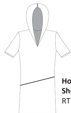
Hooded Short Sleeve RTHDSS-PS