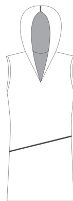
Hooded Sleeveless RTHDSL-PS