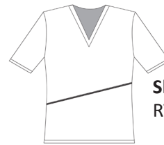
Short Sleeve RTTSS-PS