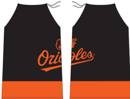
Adult - RTD01-BO Kid - RTDK01-BO (2T, 3T, 4/5, 6/7)