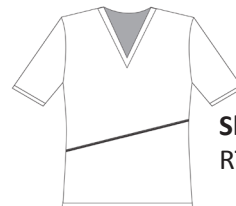
Short Sleeve RTTSS-BOA