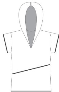
Hooded Cap Sleeve RTHTCS-BOA