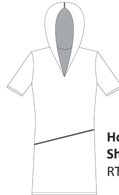
Hooded Short Sleeve RTHDSS-BO