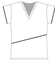
Cap Sleeve RTTCS-BOA