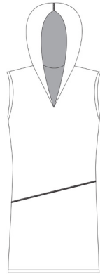
Hooded Sleeveless RTHDSL-BO