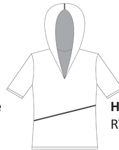
Hooded Short Sleeve RHTSS-BOA