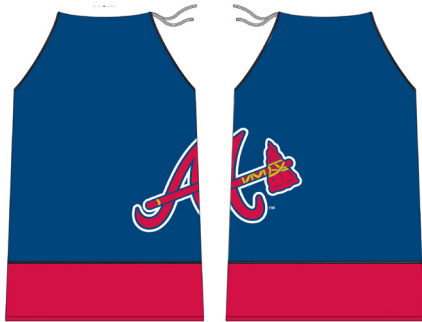
Adult - RTD01-AB